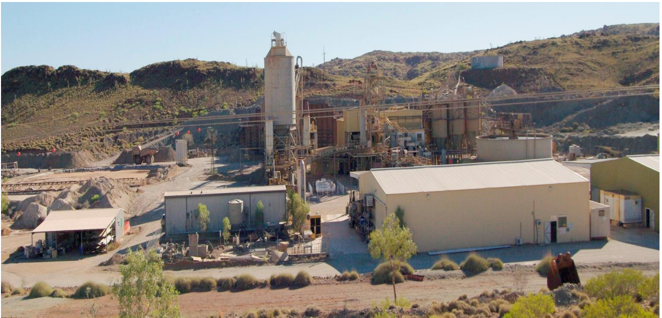
Figure 3: Bamboo Creek Processing Plant looking north, (conglomerates and sediments belonging to the prospective basal Fortescue Group are behind the range at top of photo)

The 'Metal concentrate' produced will contain sufficient quantities of 'Precious metal' for an overseas refiner to accept them and produce 'Precious metals' when refined.