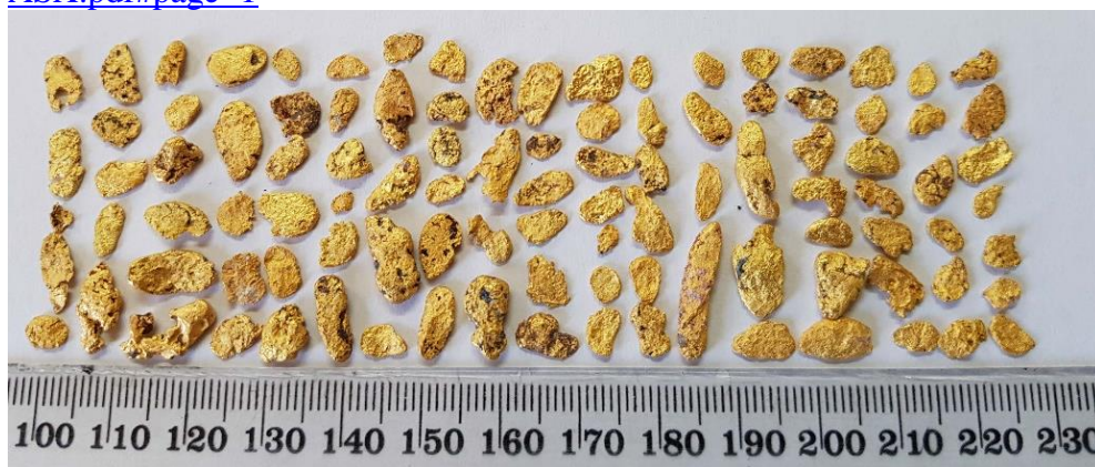
Figure 2: Nuggets collected near the surface from Just-in-Time conglomerate, south west of the Comet Mine, total weight of nuggets 33.167 grams.

https://arc-haoma.s3.amazonaws.com/uploads/2018/02/Consolidated-Correspondence-with-ASX.pdf#page=1