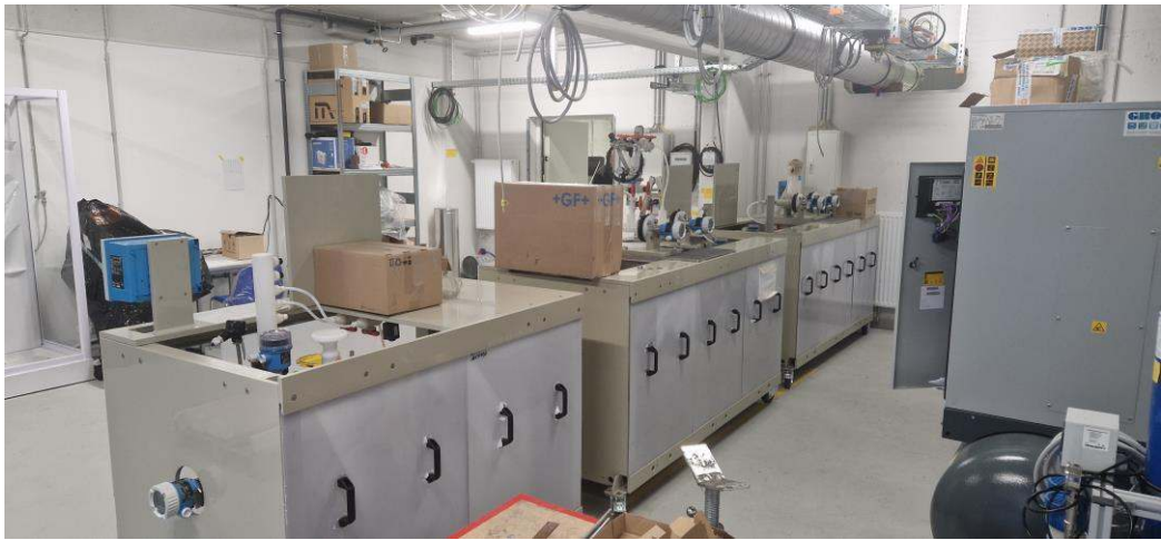
Figure 3 – Pilot Plant Test Equipment