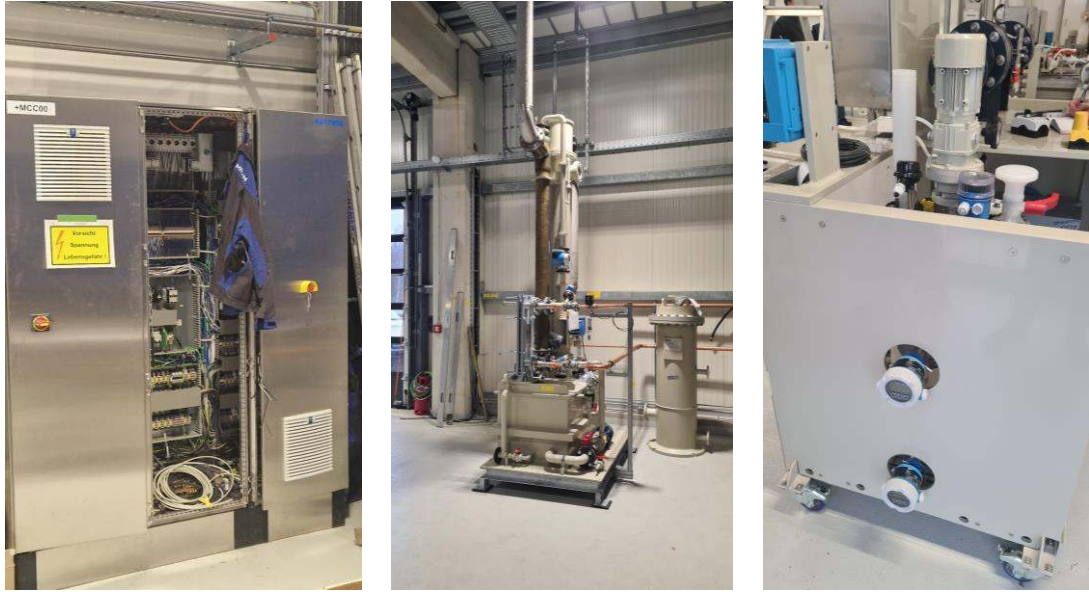
Figure 4 – Electrical Board and Various Equipment

Altech's pilot plant personnel have been recruited and trained in Germany, ready for the commissioning and start-up phase of the pilot plant. The commissioning of the front end of the pilot plant is currently underway. Aluminium chloride feedstock digestion, which will be used for the alumina coating process, will be commissioned in the subsequent weeks. The Kuettnner engineering team is now focused on the development of commissioning and operational documentation. The pilot plant is designed to produce 120kg per day of the Silumina Anodes™ product, which will then be provided to selected potential end users for product testing.