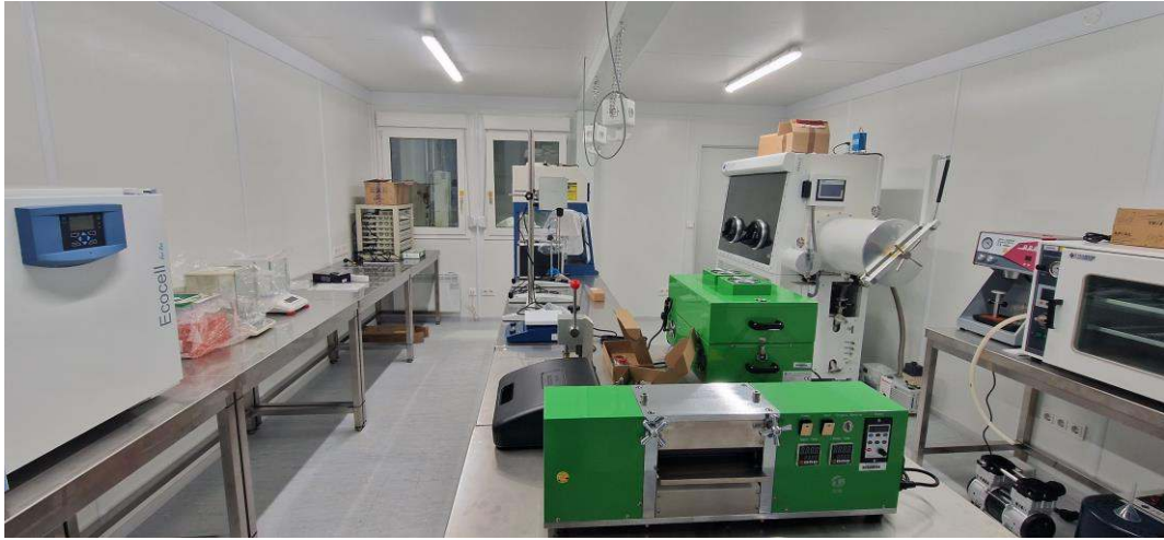
Figure 1 – Pilot Plant Laboratory