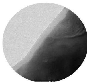
Altech alumina coated silicon

The patent applications protect Altech's process for covering anode materials such as silicon and graphite with nano-layer alumina coatings. The coatings serve as an artificial solid electrolyte interface (SEI), and can reduce lithium loss during each battery charge and discharge cycle, and also retards degradation of battery capacity throughout battery life. This current round of patent filings further demonstrates Altech's commitment to protecting its intellectual property.