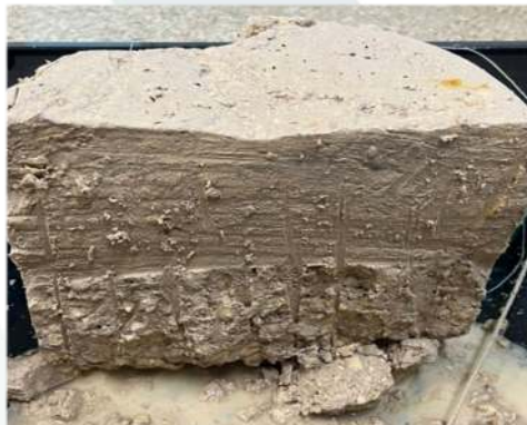
Image 1. lithium process by-product.

Since receiving (new) leached spodumene samples in December 2021, UQ researchers have completed over 80 optimisation batch tests and 25 continuous tests completed on individual process steps, involving leaching, filtration/decanting, and precipitation. The pilot has produced over 3 kgs of pure Linde Type A manufactured zeolite product (image 2.) utilising lithium process by-product as feedstock (image 1.).